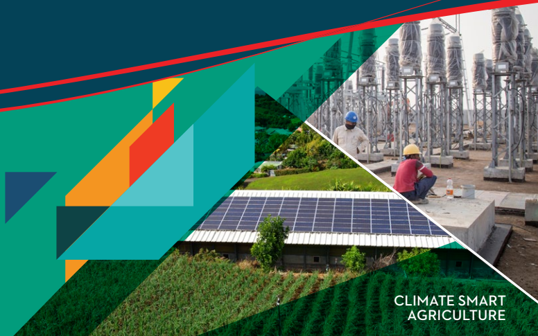
CLIMATE SMART AGRICULTURE

Canada's carbon offset markets provide the largest number of opportunities in the world for farmers to participate.